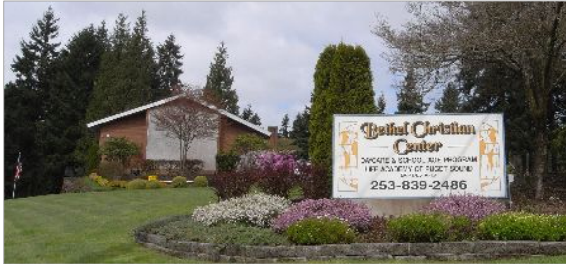
Mirror Lake Camp Meeting Site currently owned by Bethel Christian Center