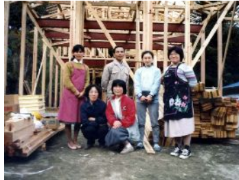
Completion of framework

After that, many of the brothers and sisters who helped build the church found jobs in other areas, or got married and moved away. “Knowing God’s time is important, and there is a time for gathering, and a time for releasing, according to His plan.” Now, the village’s small church is alive and well.