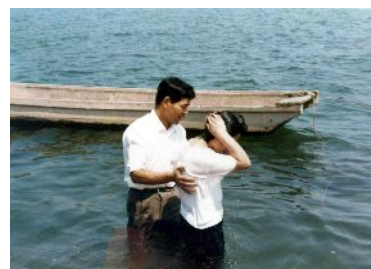
Baptism in the sea of Takada-Matsubara

While writing up this report, my heart became full of deep emotions, and my eyes welled up with tears. God's works are wonderful. From the 19th day of the 7th month of the 40th year of Showa (19 July 1965), and for five days, the neighboring town, Oofunato, was the next location for our tent gathering. The time from the Sanriku tsunami to the time we set up our tent in Oofunato was very short, so we were able to meet a lot of victims of, and view the damaged caused by, the tsunami. Many of the people who accepted Christ were baptized in the ocean and in the rivers.