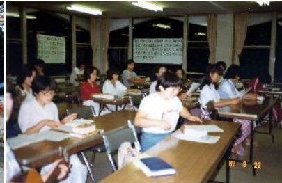
Gathering 22 August 1982