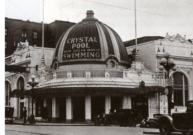
Crystal Pool 2nd and Lenora