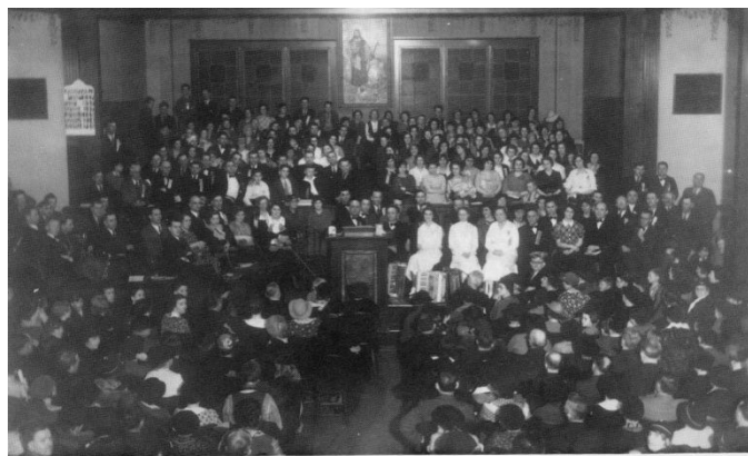
Bethel Temple, Third Avenue and Bell Street, where the congregation worshipped 23 years and many were called to enter God's harvestfield. This picture is of a missionary rally in 1935.

The spirit of prayer permeated the prayer room before services and continued throughout the service and around the altar after the ministry of the Word.