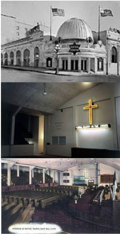
1944 Bethel Temple at 2nd and Lenora