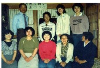
At the Old House

The 4th through the 7th month of the 58th year of Showa (April thru July 1983)