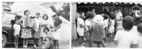
2nd Tent Gathering

More than a hundred children gathered, and they recited and heard passages from the bible. From this group, a number of children became Christians, and a few became pastors.