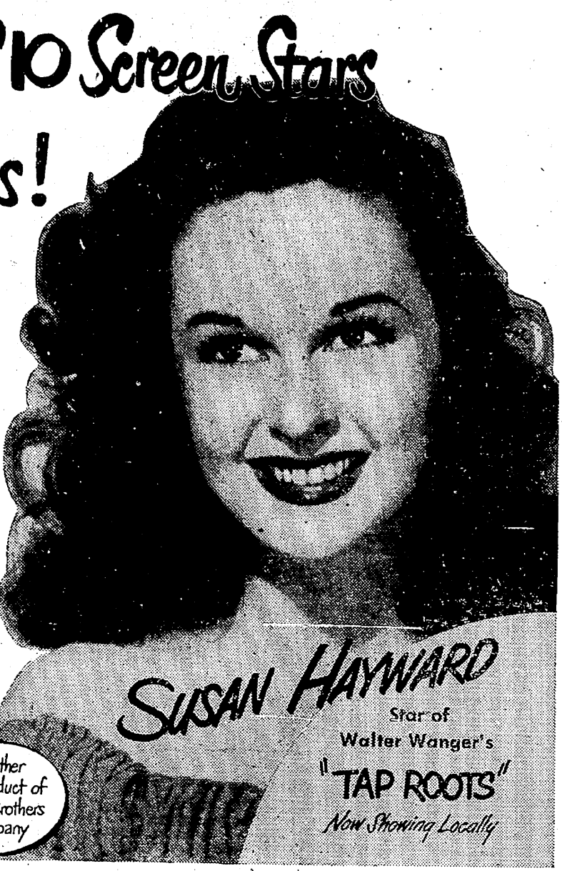
SUSAN HAYWARD Star of Walter Wanger's "TAP ROOTS" Now Showing Locally

"I work the fragrant lather in thoroughly," Susan Hayward tells you. "As I rinse and then pat with a soft towel to dry, skin is softer, smoother!" Don't let neglect cheat you of romance. Take the screen stars' tip!